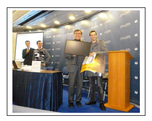
A student winning the LC monitor in a lottery

Chinese company "Shenzhen Eastar" is awarded by Diploma of SID Russia Chapter